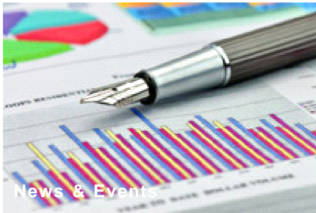
News & Events