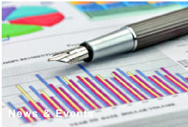
News & Events